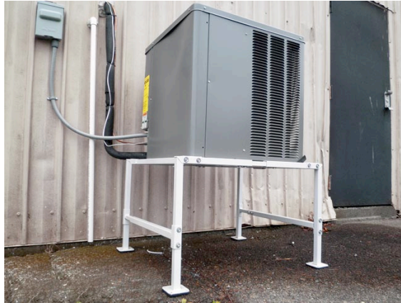
Heat Pump Stand SPECS QSTD2001

Applicable for residential or light commercial installations