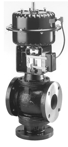
V-9502 Positioner Installed on a Rubber Diaphragm Type Valve Actuator

The starting point is the input pressure (Pilot P pressure) at which the actuator just begins to stroke. The starting point is field adjustable from 2 to 12 psig (14 to 83 kPa) using the starting point adjusting screw located under the V-9502 Positioner cover. Turning the screw clockwise decreases the starting point, and turning the screw counterclockwise increases the starting point.