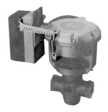
V-9502 Positioner Installed on a Typical V-3000 Type Valve Actuator

The span and starting point adjustments of the V-9502 Pneumatic Valve Actuator Positioner determine the operating range. The lower value of the operating range is the control signal pressure at which the actuator just begins to stroke. The upper value of the operating range is the control signal pressure at which the actuator reaches its maximum stroke. The difference between the upper and lower values of the control signal pressure is the operating span.