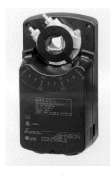
Figure 1: M91xx Series Actuator

A single M91xx model delivers up to 280 lb·in (32 N·m) of torque. Two AGx, GGx, or HGx models in tandem deliver twice the torque or 560 lb·in (64 N·m). The angle of rotation is mechanically adjustable from 0 to 90° in 5-degree increments. Integral auxiliary switches are available to indicate end-stop position or to perform switching functions at any angle within the selected rotation range. Position feedback is available through switches, a potentiometer, or a 0 (2) to 10 VDC signal.