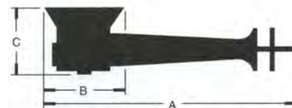
S5S, S8S, S12S

NOTE: See page 18 for flame characteristics.