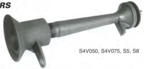
S4V050, S4V075, S5, S8