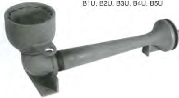
B1U, B2U, B3U, B4U, B5U

These burners do not come with pilots as standard units, consequently if a pilot is desired, your order should so state.