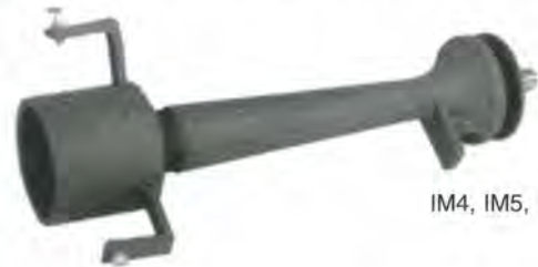
IM4, IM5, IM6

DESCRIPTION: The heads of these burners are cylindrical in shape, with brackets that attach directly to your immersion tube. The grid is designed to produce a long sharp flame.