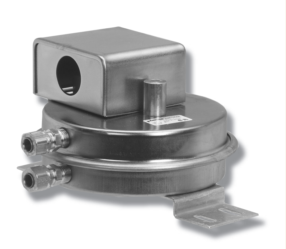
Model - SML

Antunes Controls is one of the leading manufacturers of pressure control switches. Our sheet metal air differential switches are compact, sensitive, and reliable. Their design is based on the same principles of reliability, repeatability and accuracy that has made our line of pressure switches so successful.