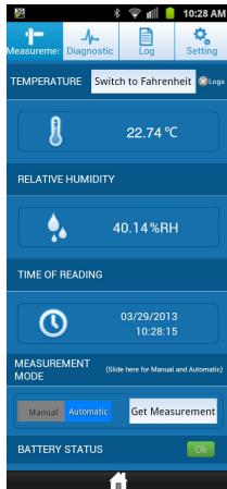
Fig. 4: Blü-Test App Measurement Screen on a Smart Phone.*

*The Temperature-Only version will not show the humidity information.