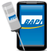
Fig. 1: Blü-Test Application Icon on “Google Play”